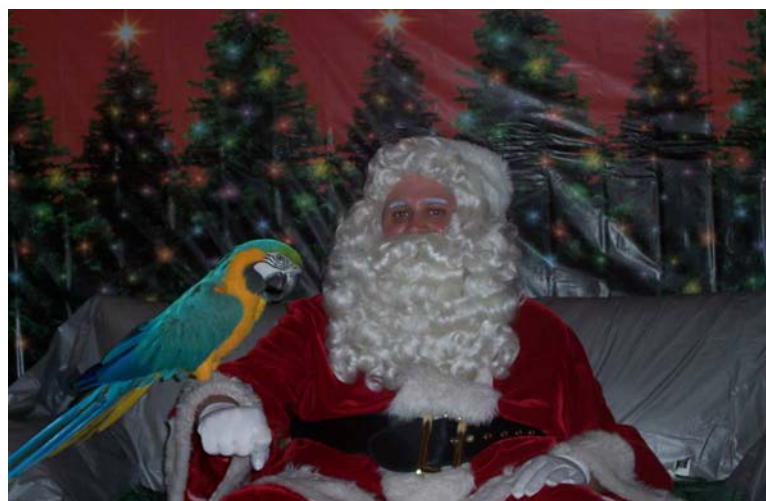
Even Tikki, the parrot, didn't want to miss out on having a picture with Santa.