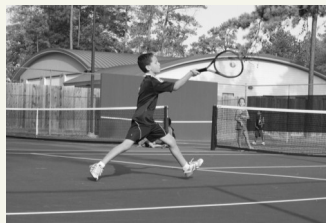
September LHOA Youth Tennis Tourney

Our children will surely be thankful for the upcoming school holiday. Klein schools